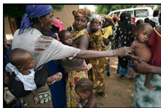
On the edge of the Sahara desert in Western Africa, international aid workers try to help hundreds of thousands of children facing malnutrition because of food shortages created by drought and high prices.

The food crisis in Niger continues as the death toll mounts despite attempts to bring in foreign aid. While nearly $20 million has been contributed by foreign donors, tangible assistance often arrives after many in an area have died. Some say the U.N. underestimated the depth of the crisis early on, making timely aid difficult at this stage in the crisis.