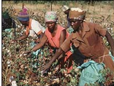
Brazil says US subsidies are hurting smaller cotton producers

US cotton subsidies which have fuelled a long-running trade dispute with other countries are to be scrapped, the Bush administration has revealed.